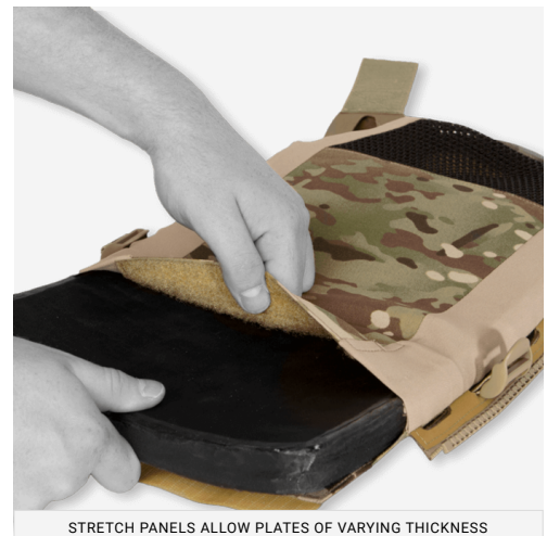
STRETCH PANELS ALLOW PLATES OF VARYING THICKNESS