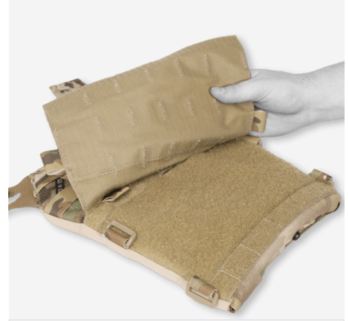
VELCRO PANEL ALLOWS FOR DETACHABLE FLAPS