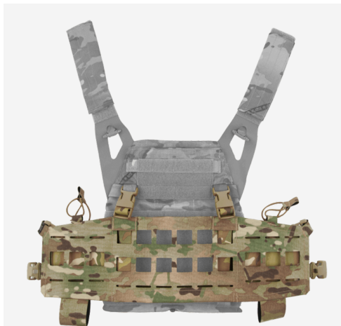
WEBBING LOOPS SUPPORT DETACHABLE CHEST RIGS