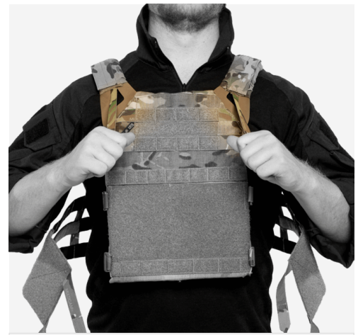
SHOULDER STRAP E-DOFF PULL TABS