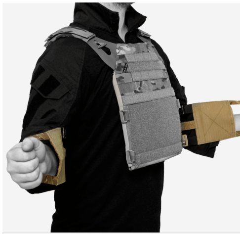
CUMMERBUND E-DOFF GRAB HANDLES