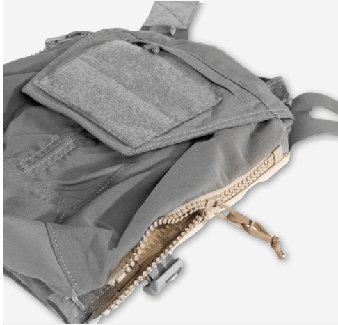
ZIP-ON BACK PANEL COMPATIBLE