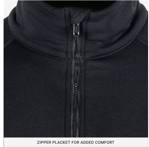
ZIPPER PLACKET FOR ADDED COMFORT