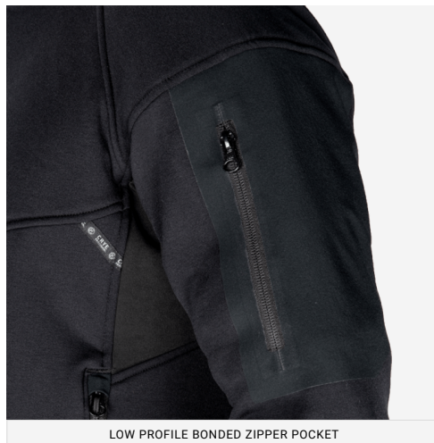
LOW PROFILE BONDED ZIPPER POCKET