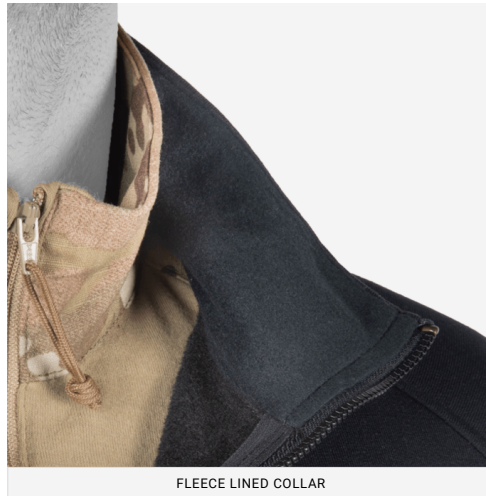
FLEECE LINED COLLAR