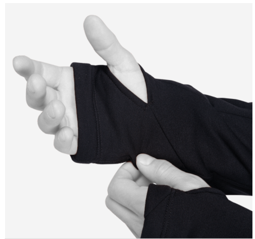
INTEGRATED THUMBHOLE AT SLEEVE CUFF