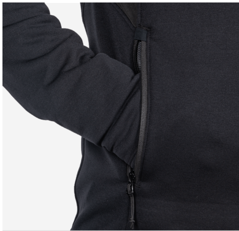
ZIPPERED HAND POCKETS WITH STOWABLE ZIPPER PULL