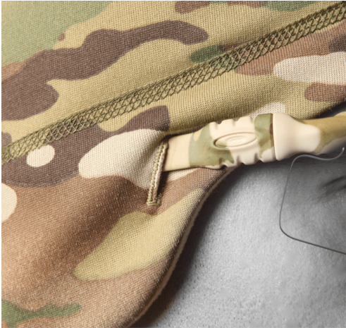
EYELETS FOR EYE PROTECTION