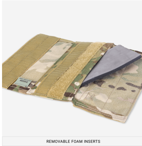
REMOVABLE FOAM INSERTS