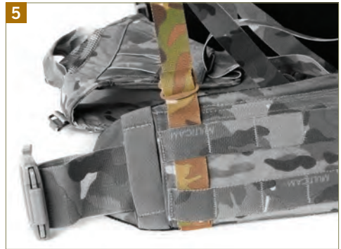
Rear straps attached to the belt.