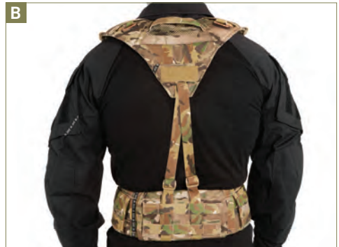
AVS™ Padded Yoke with belt (back)