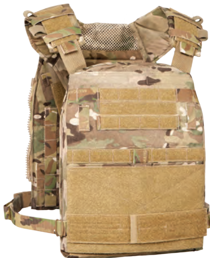
AVS™ Padded Yoke attached to the AVS™ Platebags