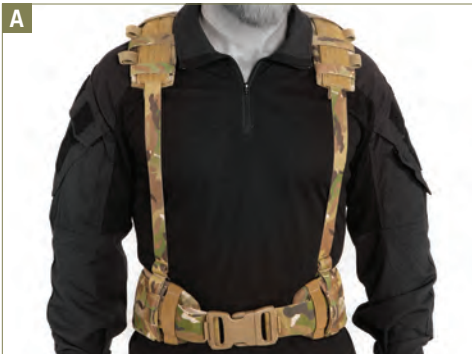
AVS™ Padded Yoke with belt (front)