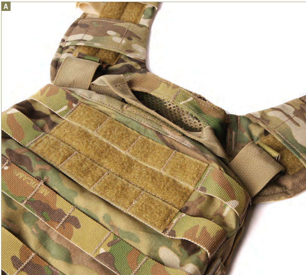
AVS™ Padded Yoke attached to an AVS™ Platebag.