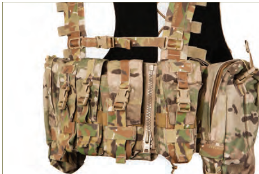
*Chest rig with top bib stored in the down position.

The top flap of the chest rig can be stored in the down position if the user desires. Unsnap the top-right and top-left webbing tabs and fold the top bib into the plate pocket.